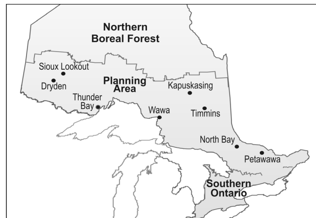
Figure 1. NEBIE plot network installation sets in Ontario.